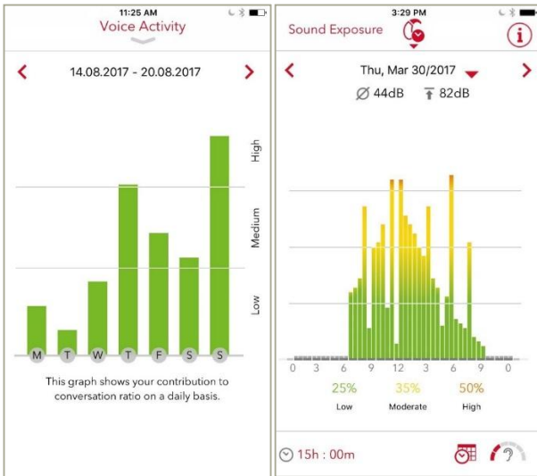
The Voice Activity & Sound Exposure pages in myControl App 2.0.